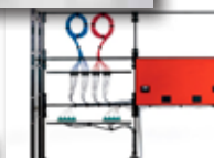
Power and Data